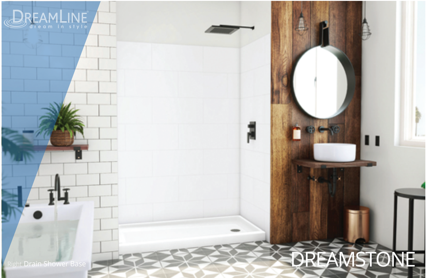
Right Drain Shower Base