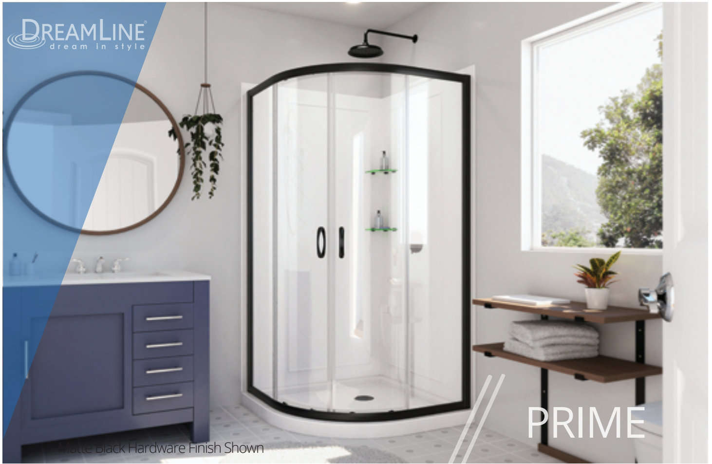
Matte Black Hardware Finish Shown