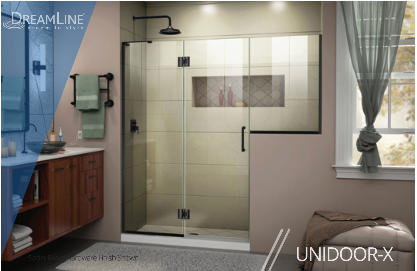
Satin Black Hardware Finish Shown