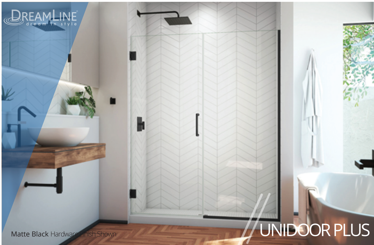
Matte Black Hardware Finish Shown