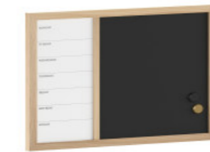
Light Natural Woodgrain