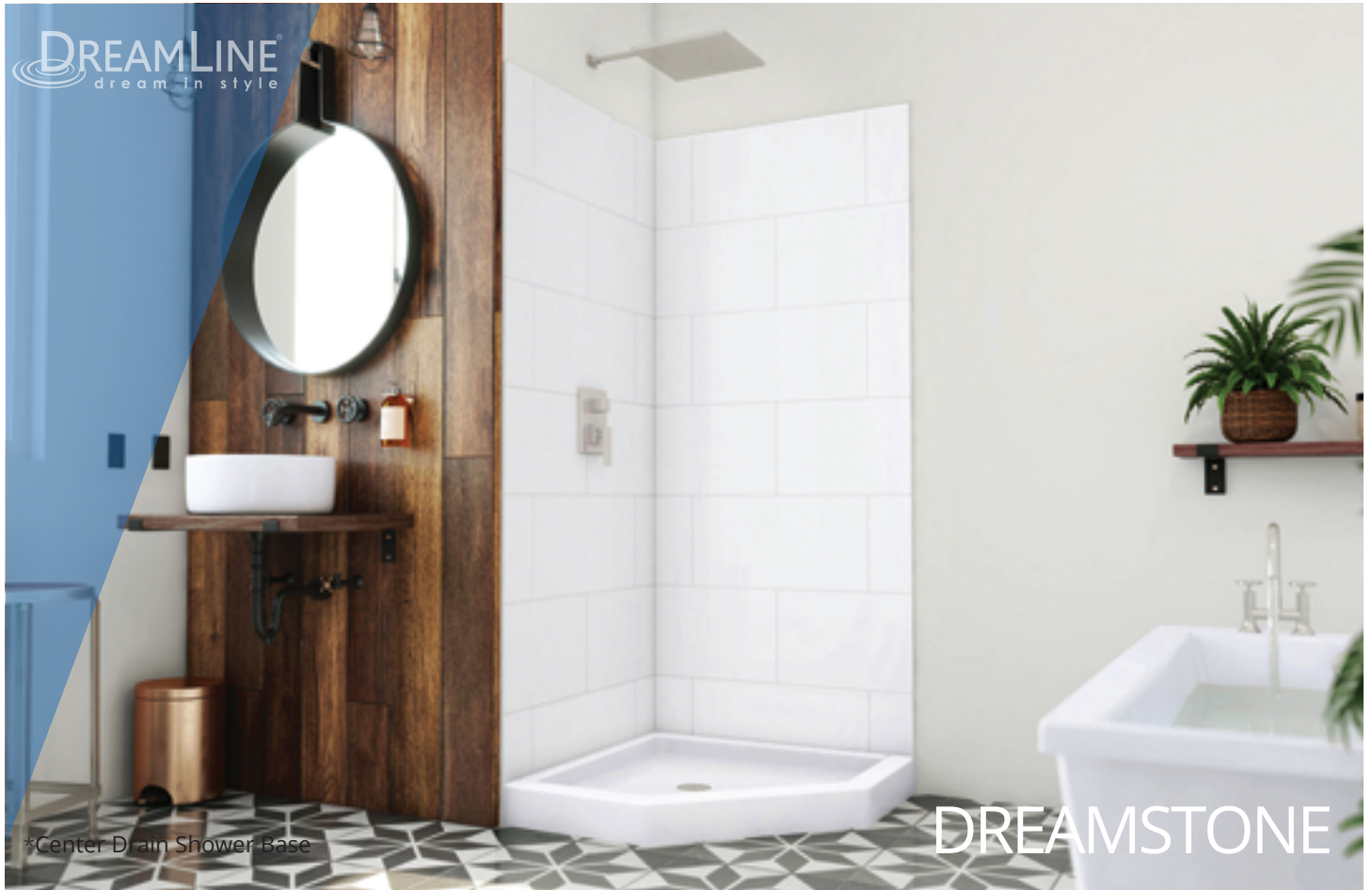
*Center Drain Shower Base