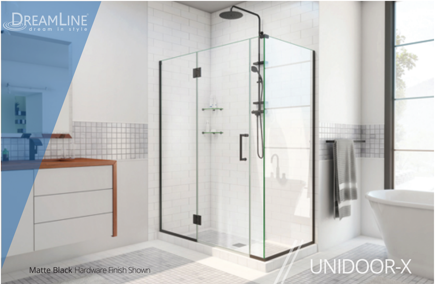
Matte Black Hardware Finish Shown