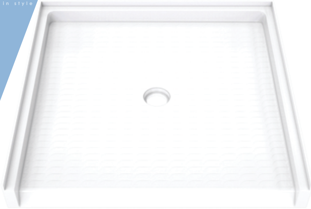
*Center Drain Shower Base