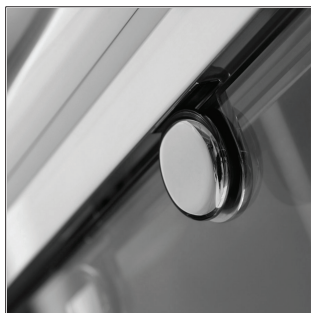
Shower Door Roller