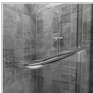
Shower Door Handle