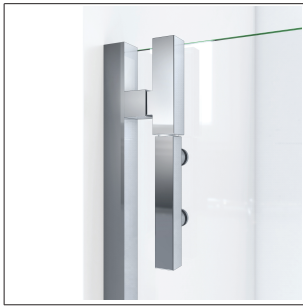
Shower Door Top Pivot