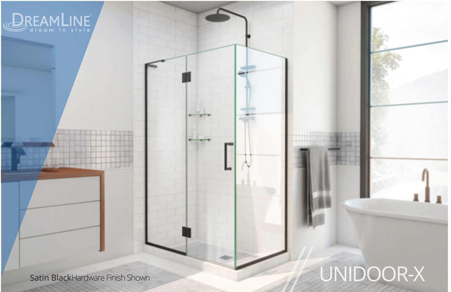
Satin Black Hardware Finish Shown