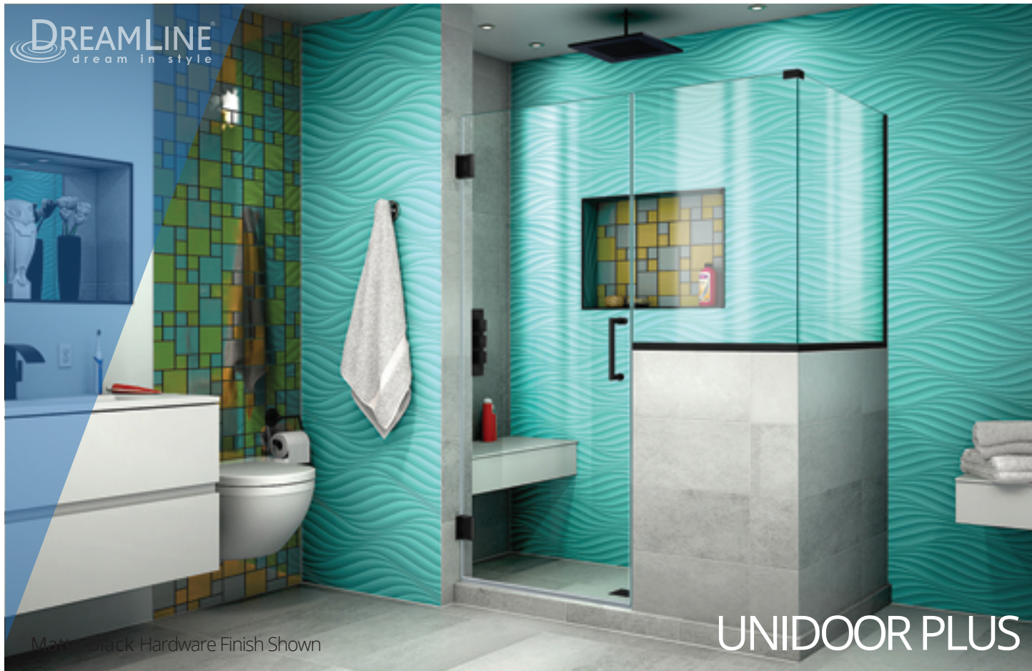
Matte Black Hardware Finish Shown