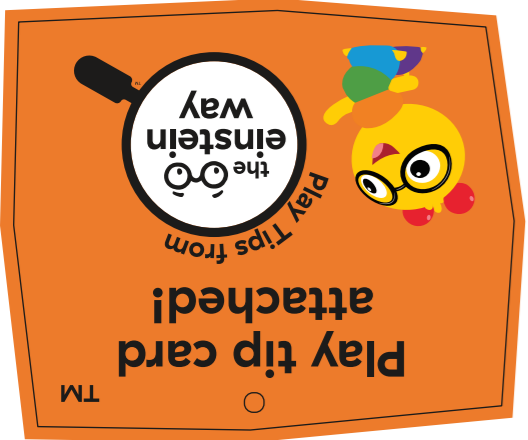
Hangtag made from same material as box