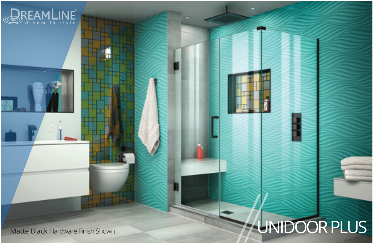
Matte Black Hardware Finish Shown