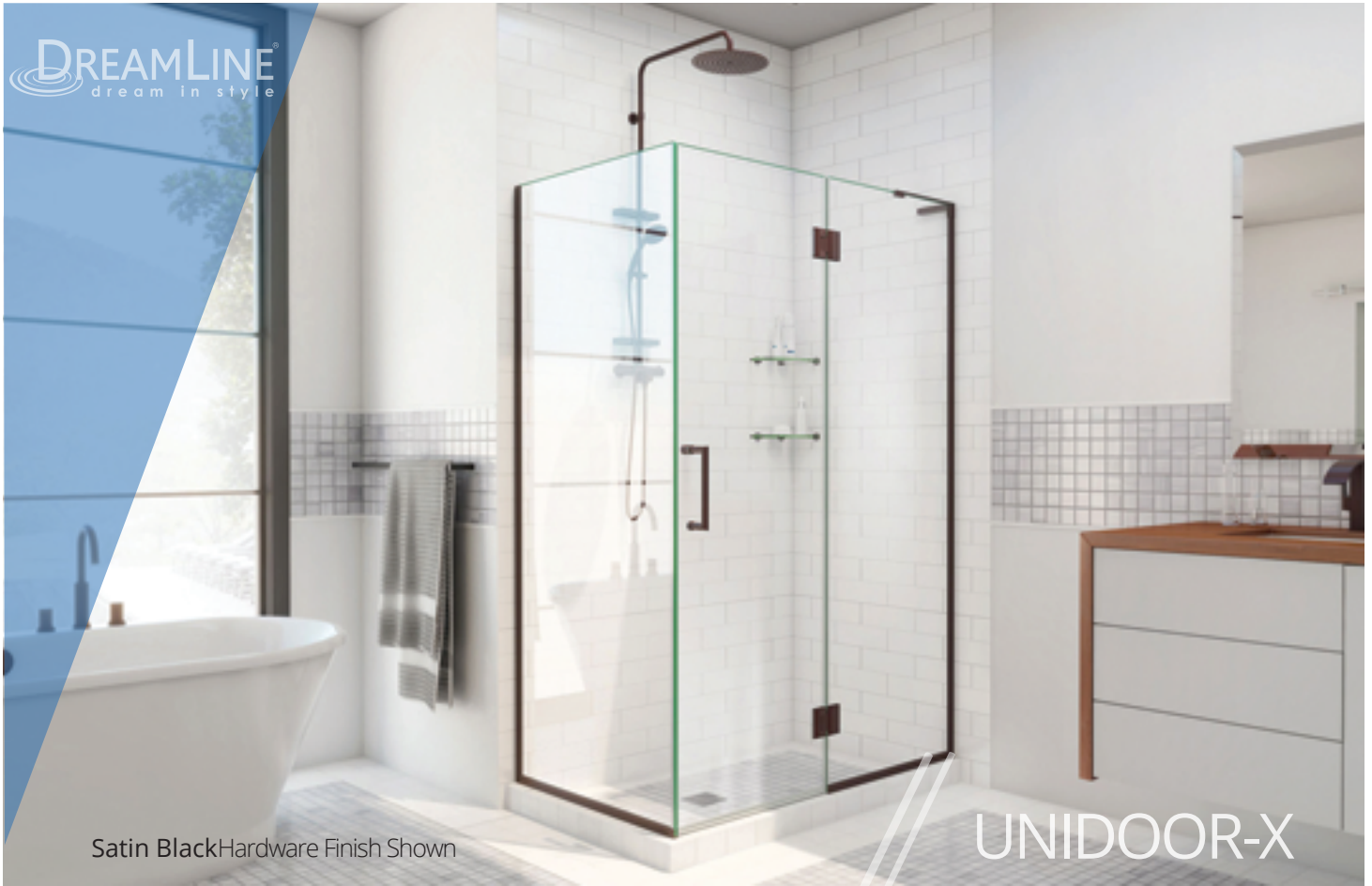
Satin Black Hardware Finish Shown