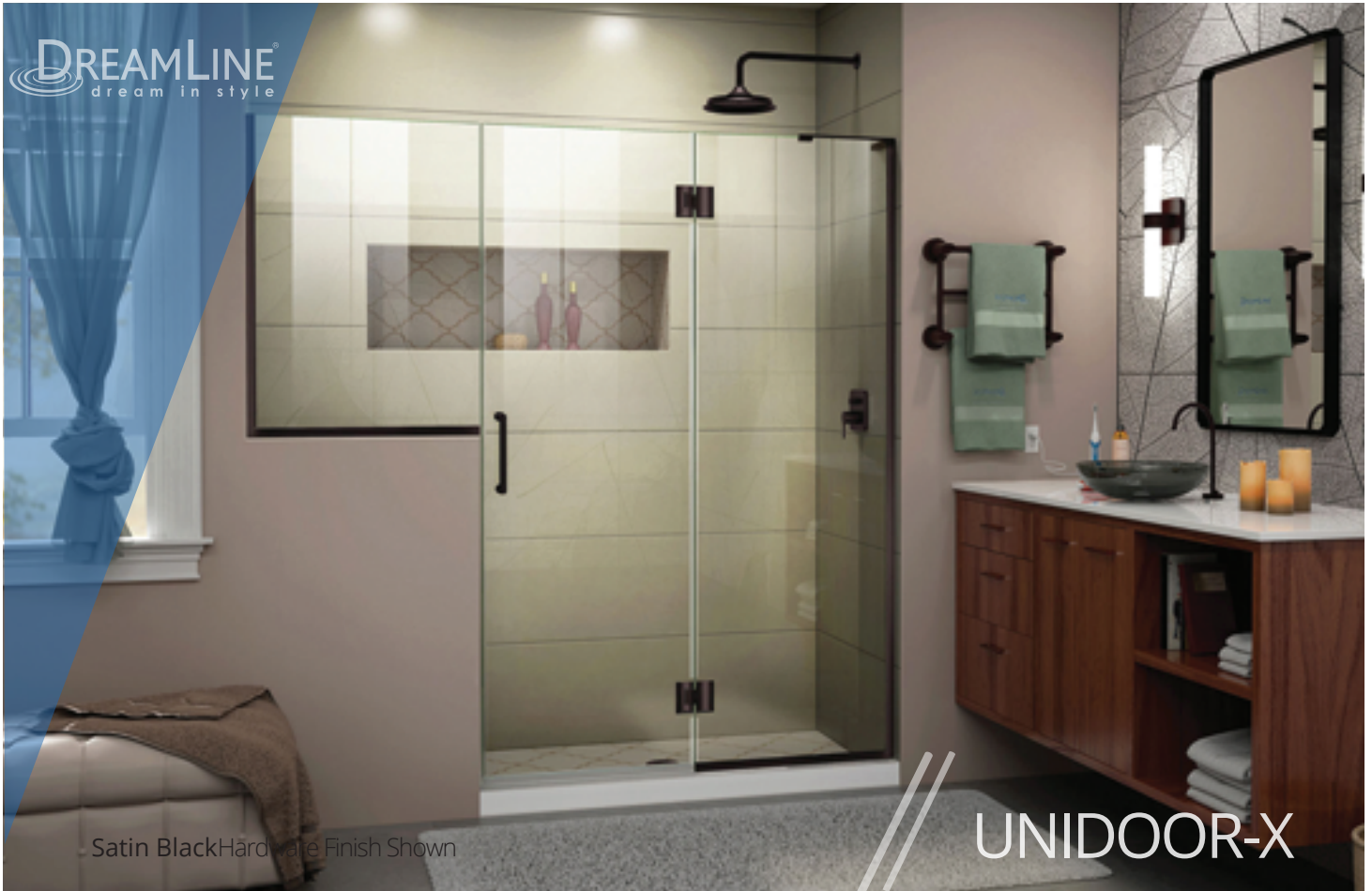
Satin Black Hardware Finish Shown