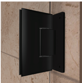
Black Satin Wall to Glass Hinge