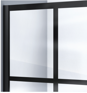
Unidoor Toulon Glass Pattern