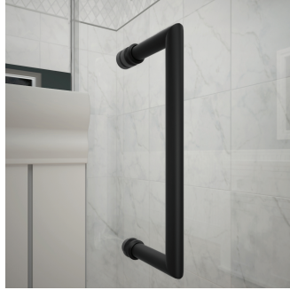
Unidoor Door Handle