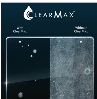
DreamLine exclusive ClearMax water and stain resistant glass coating

If this unit is going to be installed in a new construction, please, install all of the required plumbing and drainage before installing the shower. Use a competent and licensed plumber for all plumbing installation period.