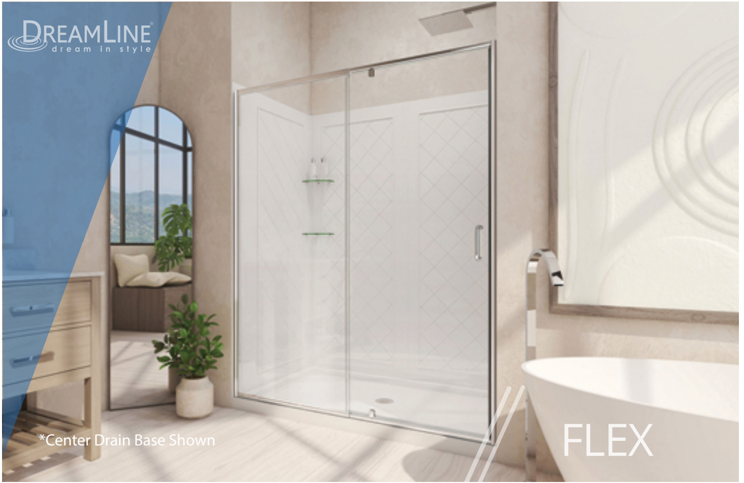
*Center Drain Base Shown