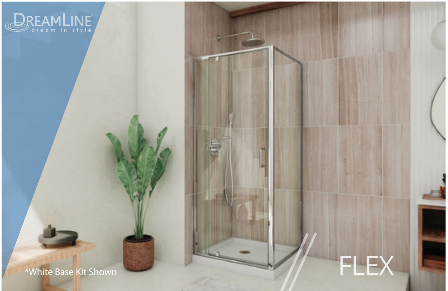
*White Base Kit Shown