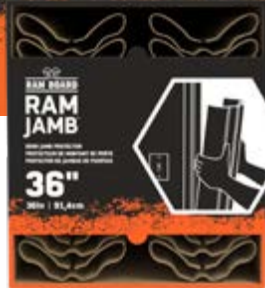
RBJP36DSP display box