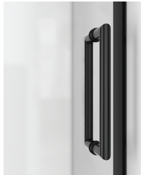
Modern Shower Door Handle

If this unit is going to be installed in a new construction, please, install all of the required plumbing and drainage before installing the shower. Use a competent and licensed plumber for all plumbing installation period.