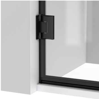
Unidoor Edge Bottom Corner