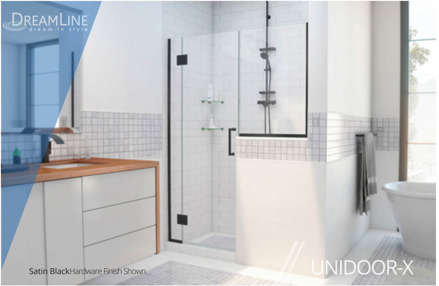
Satin Black Hardware Finish Shown