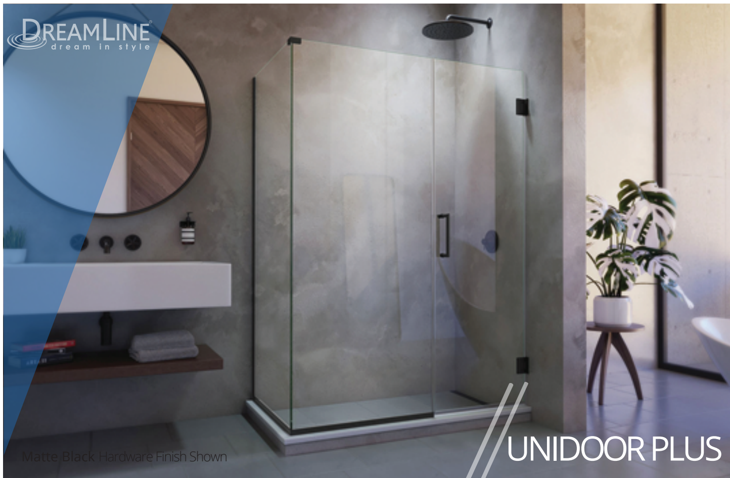
Matte Black Hardware Finish Shown