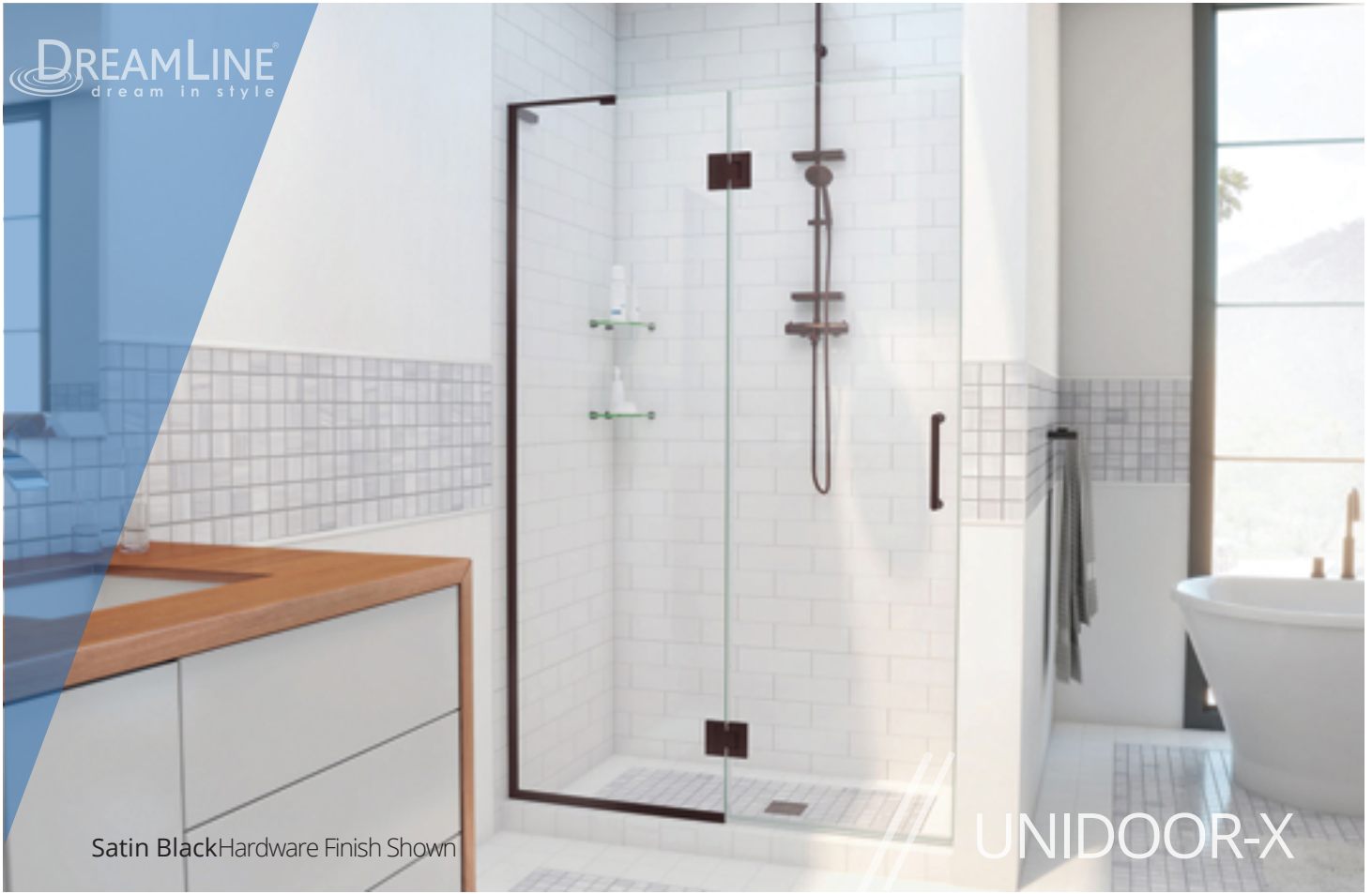
Satin Black Hardware Finish Shown