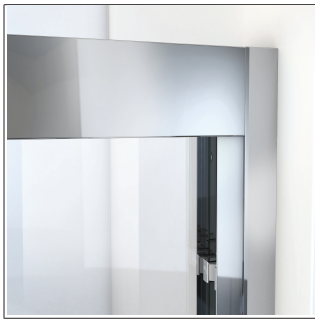
Shower Door Wall Profile