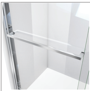
Shower Door Handle