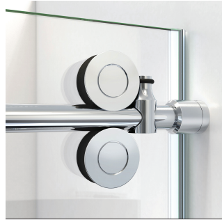
Shower Door Rollers

If this unit is going to be installed in a new construction, please, install all of the required plumbing and drainage before installing the shower. Use a competent and licensed plumber for all plumbing installation period.