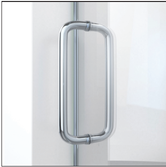
Shower Door Handle