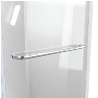
Towel Bar Included