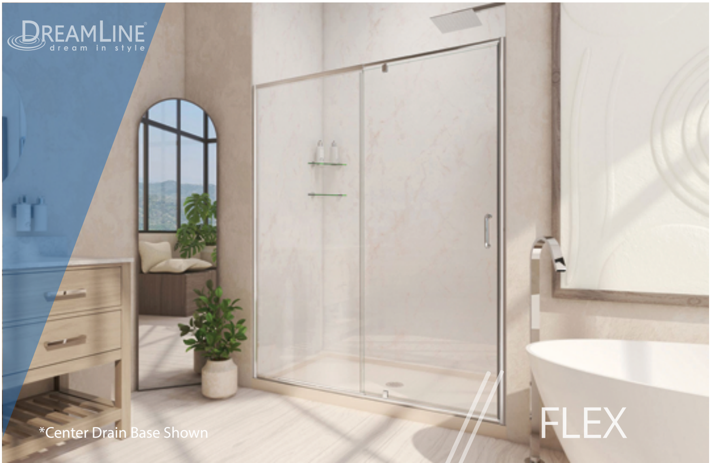
*Center Drain Base Shown