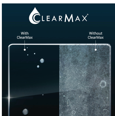
ClearMax Glass Coating