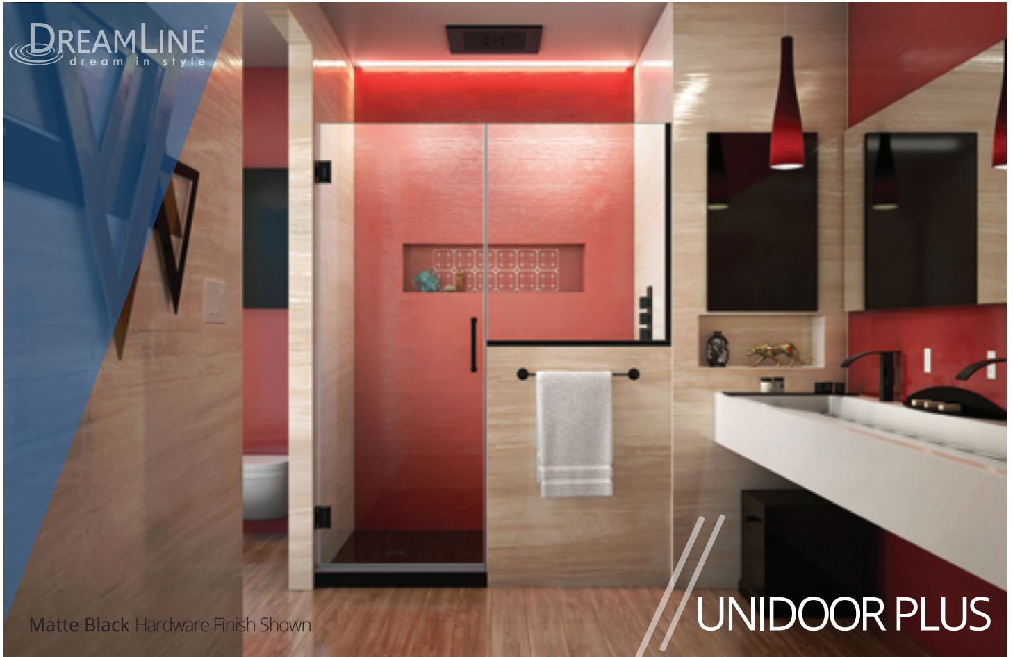
Matte Black Hardware Finish Shown