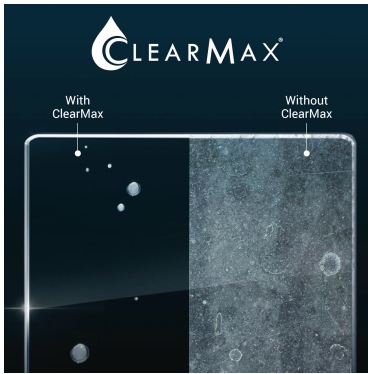
ClearMax Glass Coating