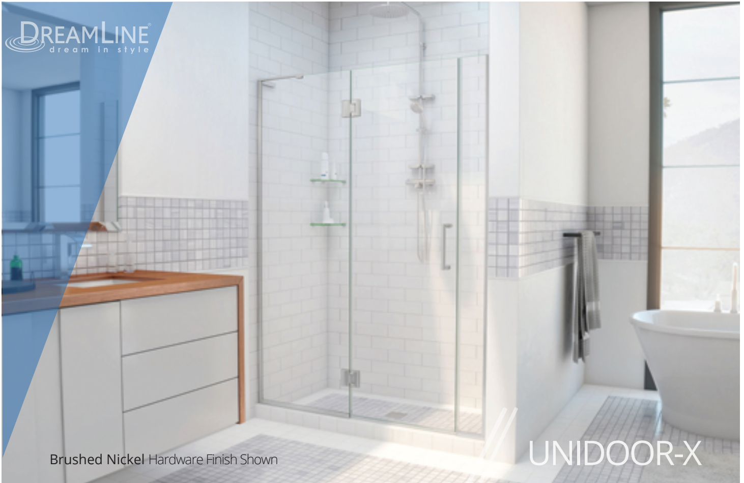
Brushed Nickel Hardware Finish Shown