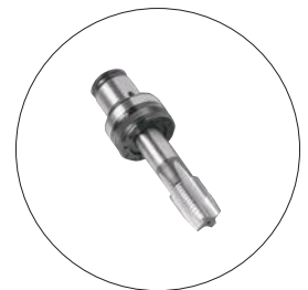
Torque drive tap holder shown with tap