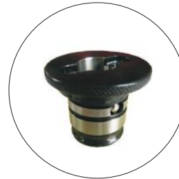
9680550 Adaptor for size 2 to 1- fits size 2 quick change adaptor and accepts all size 1 tap holders