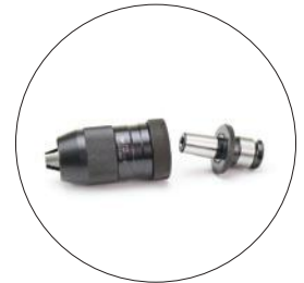
9680515 Drill chuck with size 1 quick change adaptor