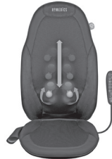
Moving Gel Shiatsu massage mechanism

For your safety, heat cannot be turned on if massage is not selected.