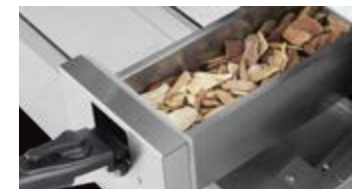
Built-in electric smoker box