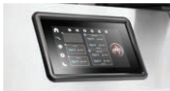
Smart mode with intelligent gas automation