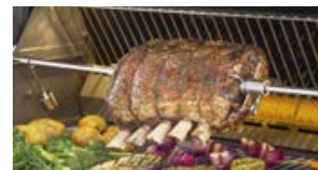
Infrared rear rotisserie burner with included high capacity rotisserie kit