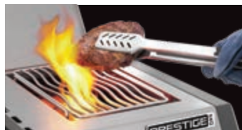
Infrared SIZZLE ZONE® side burner