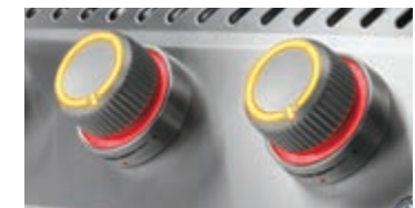
SmartGlow™ technology knobs