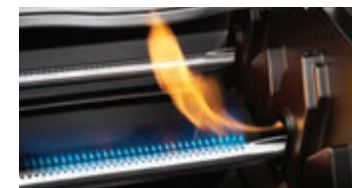
JETFIRE™ 2.0 ignition