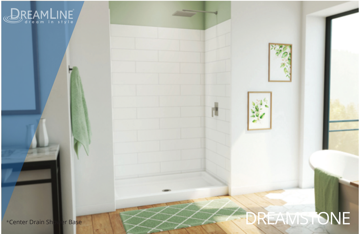
*Center Drain Shower Base