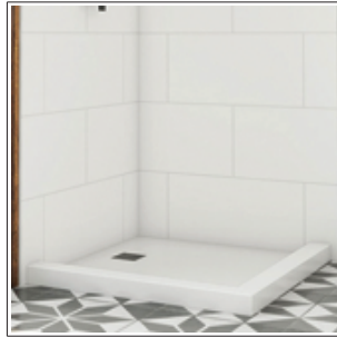
Base Is NOT included

The DreamStone collection offers popular horizontal subway patterns without the hassle of difficult installation. The durable, non-porous solid surface material makes DreamStone wall panels resistant against mold, chips, and cracks while maintaining its beautiful color for years to come.