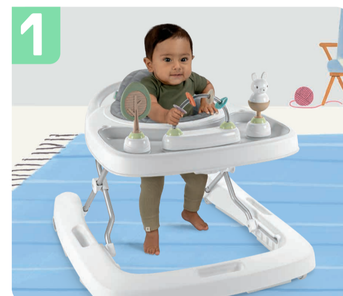
1 Andadora con actividades (6-12 meses)