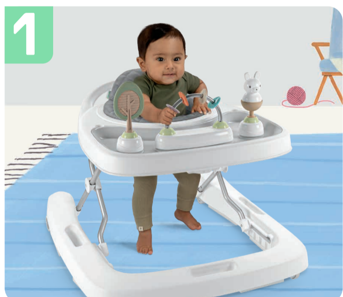
1 Activity Walker (6-12 months)