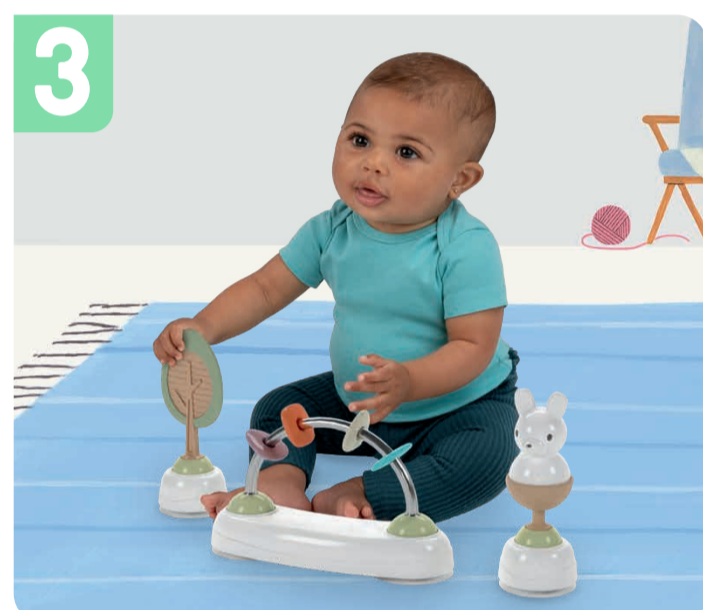
3 Removable Suction Cup Toys (6+ months)