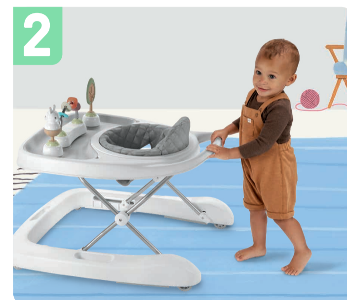
2 Andadora para empujar (12-24+ meses)