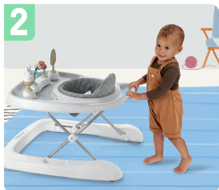
2 Push-Behind Walker (12-24+ months)