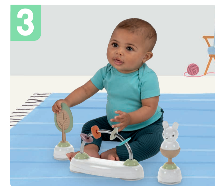
3 Juguetes con ventosas que se pueden desmontar (6+ meses)