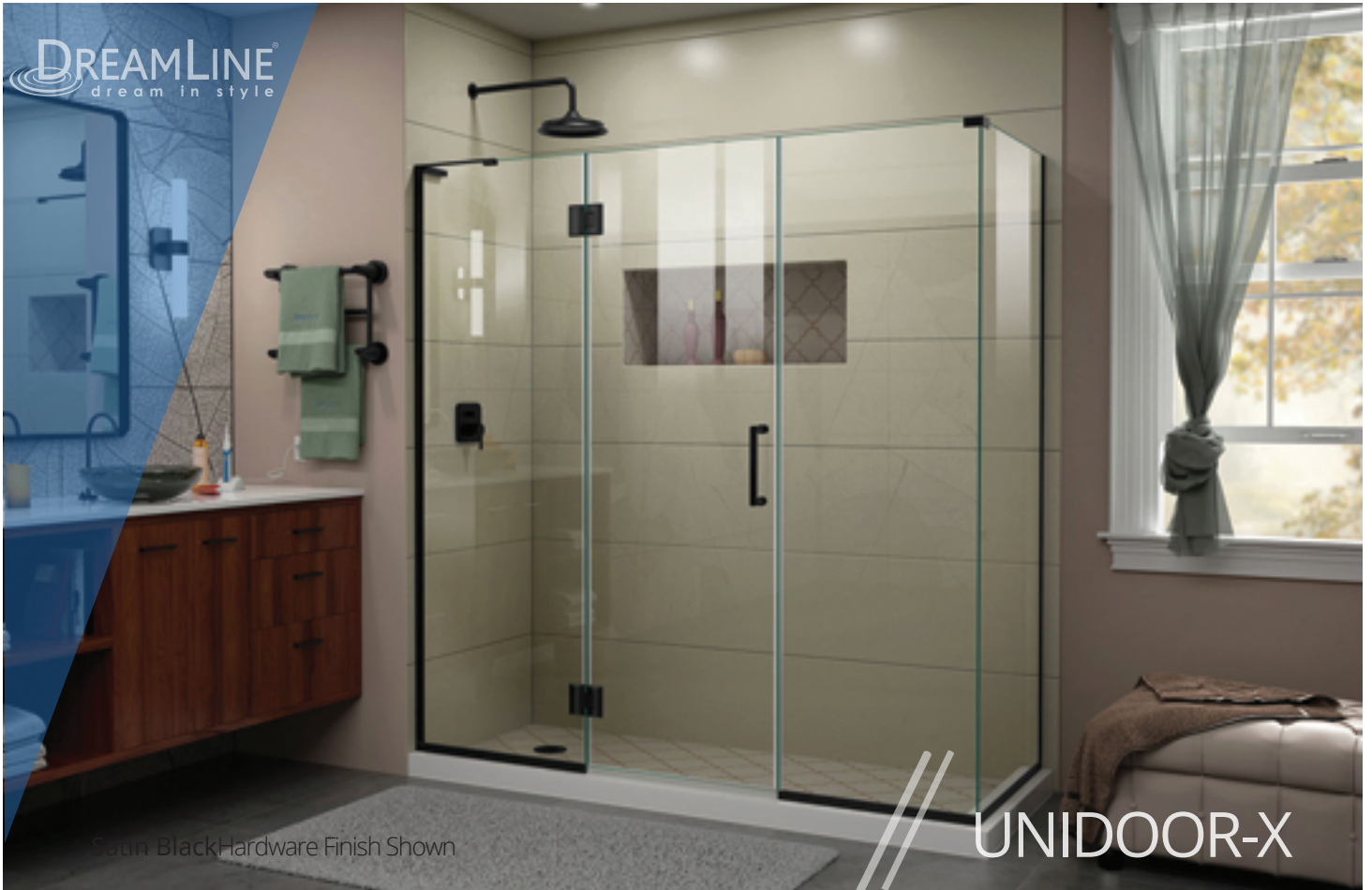
Satin Black Hardware Finish Shown