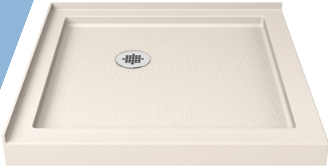
*Center Drain Base in Biscuit Finish Shown