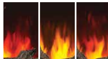
Orange, yellow and combined flame color options featuring spark technology