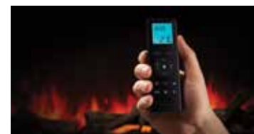
Included premium remote, Napoleon Home mobile app or optional wall mount control