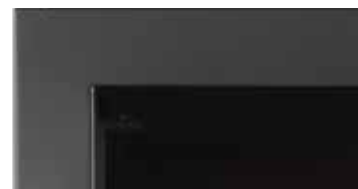
Enjoy a frameless appearance or install the incl. adjustable finishing trim