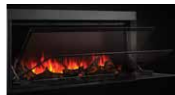
Unique flip-down style glass so you can easily change the media