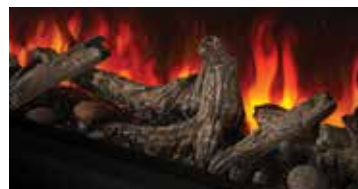
Beach Fire logs and Woodland media kit included for a realistic appearance