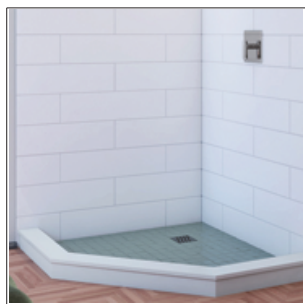
Base Is NOT included

The DreamStone collection offers popular horizontal subway patterns without the hassle of difficult installation. The durable, non-porous solid surface material makes DreamStone wall panels resistant against mold, chips, and cracks while maintaining its beautiful color for years to come.