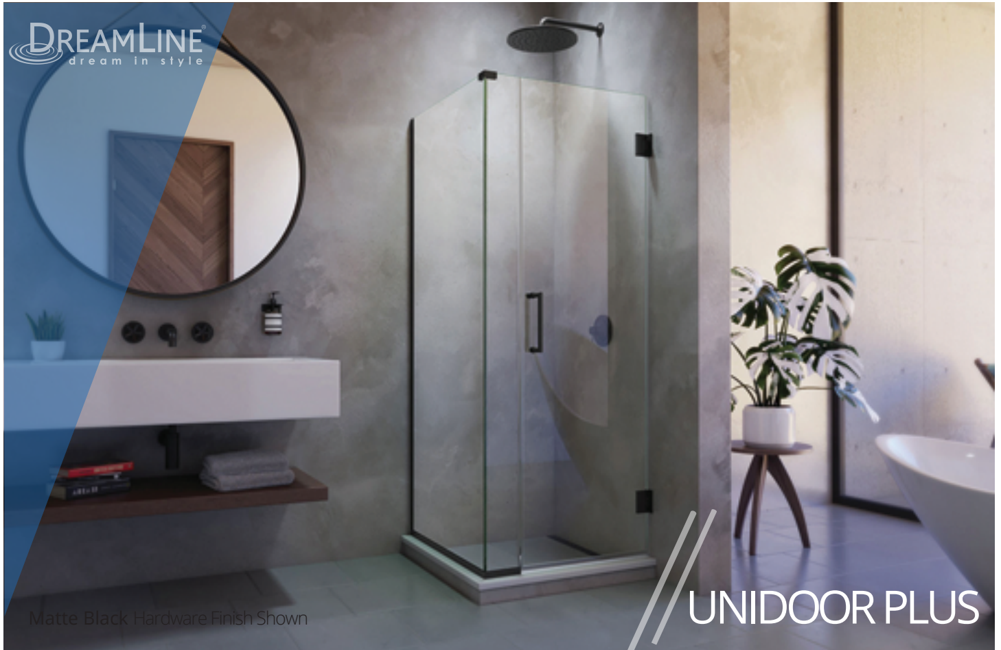
Matte Black Hardware Finish Shown