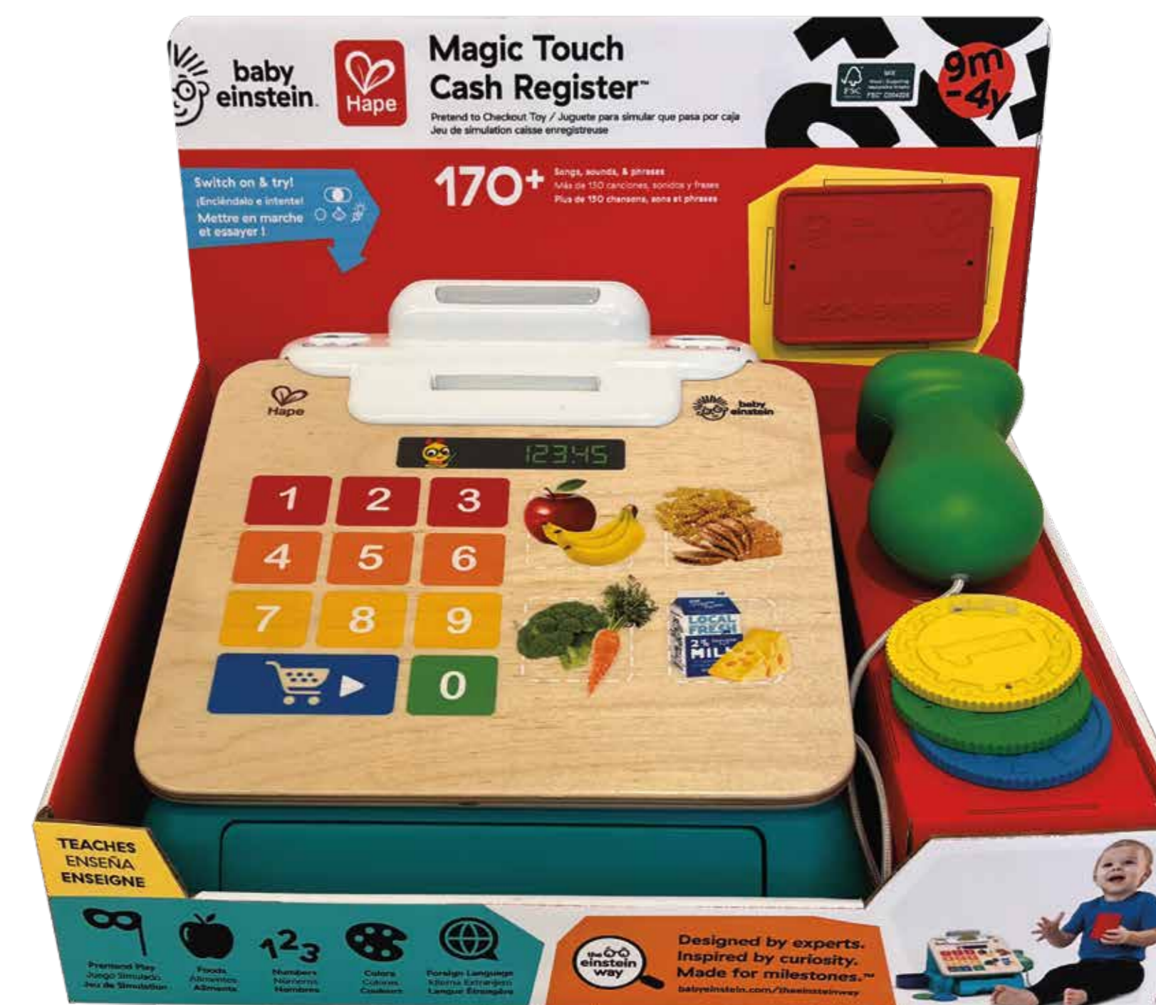
using 1 Zip Tie attach 4x5 playtip card below product using die cut holes