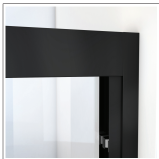
Shower Door Wall Profile