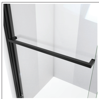
Shower Door Handle