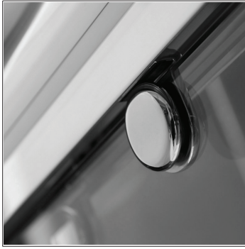
Shower Door Roller