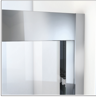
Shower Door Wall Profile