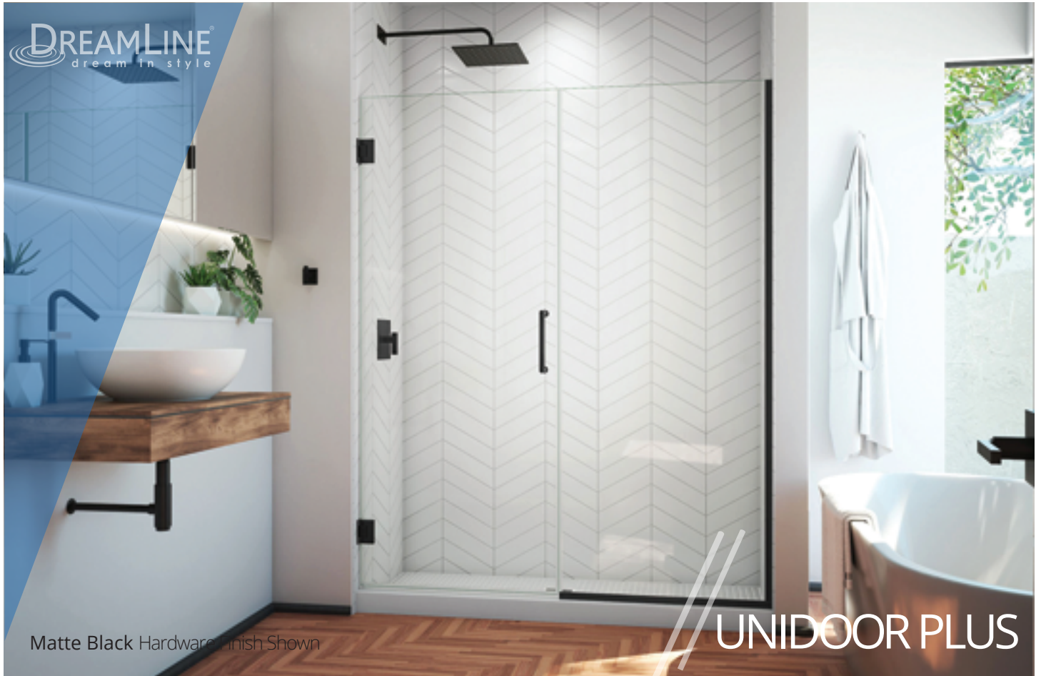
Matte Black Hardware Finish Shown