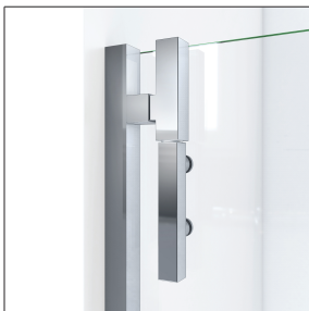
Shower Door Top Pivot