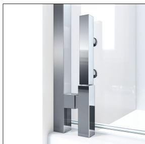
Shower Door Bottom Pivot