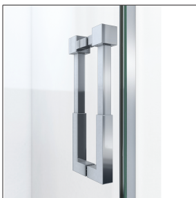
Shower Door Handle