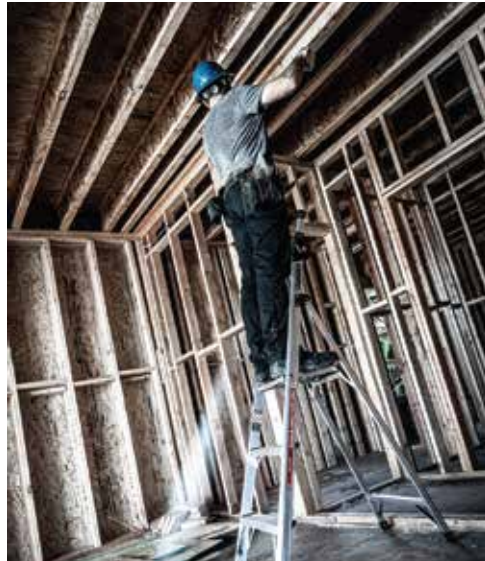
Gets the Job Done