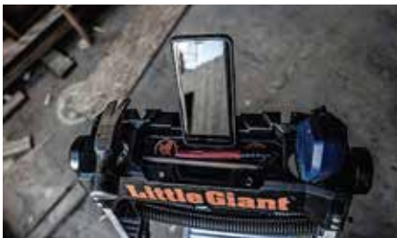
Large Tray Holds Tools and Supplies