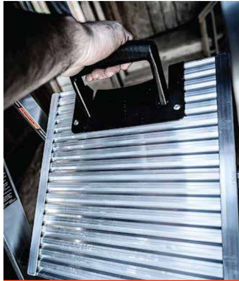
Quick Release Handle Keeps You on the Go