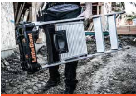
Lightweight and Easy to Transport