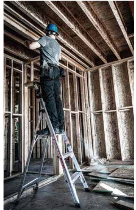
More Speed, Less Fatigue