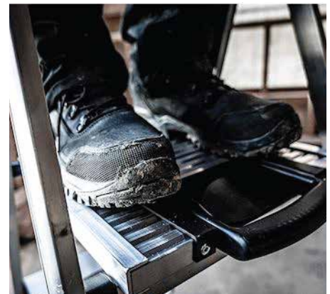
Massive Standing Platform for Comfort