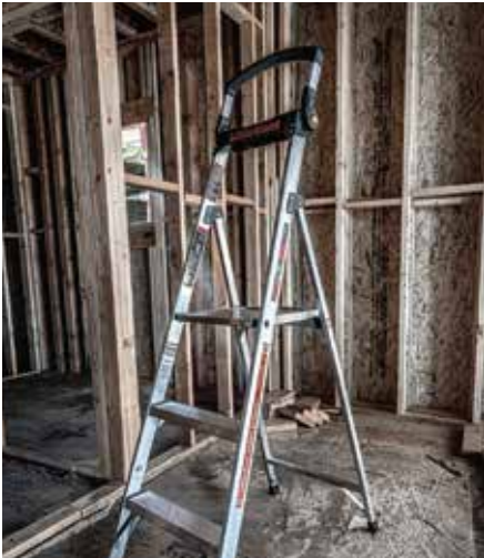
Simple Stepladder Helps You Work Fast