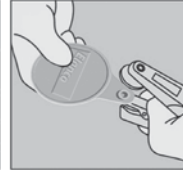
Figure 2 Slide tag under the clip of the pliers by depressing the lever.