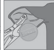
Figure 3 Position tag in the center portion of the front side of the ear.