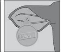
Figure 4 Apply the tag between the second and third rib cartilage.

Continual exposure of horn flies to a single class of insecticide (e.g., pyrethroids or organophosphates) may lead to the development of resistance to that class of insecticide. In order to reduce the possibility of horn flies developing resistance it is important to rotate the class of insecticide used and/or the method of horn fly control on a seasonal basis. CyLence Ultra Insecticide Cattle Ear Tags contain the pyrethroid insecticide beta-cyfluthrin plus piperonyl butoxide, which is an insecticide synergist.